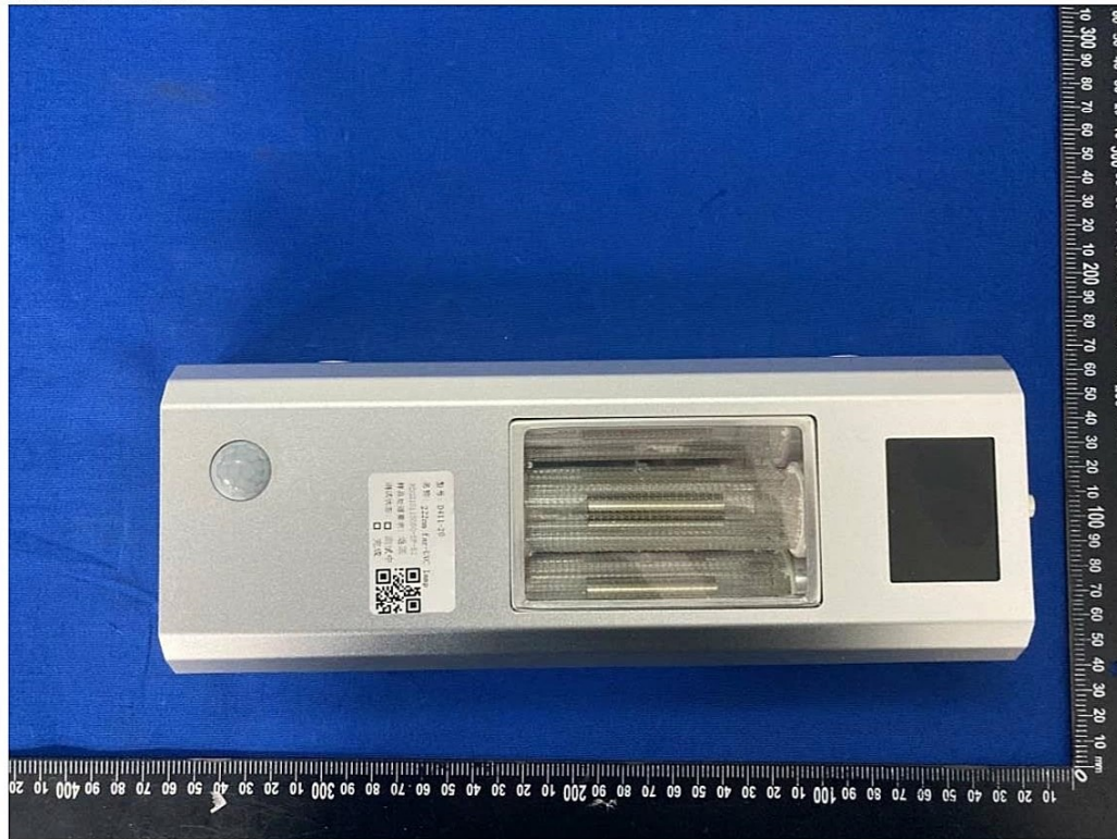
The overall view of EUT